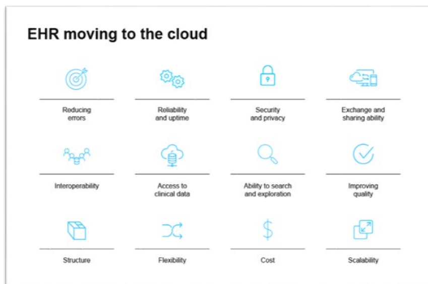
Figure 1: Benefits of moving EHR to the cloud

Moving your EHR database fully to the cloud provides numerous benefits (see Figure 1) and enables greater agility since AWS infrastructure is designed to flex as needs change. The fluidity of the cloud's pay-as-you-go pricing and scalable infrastructure allows organizations to trade finite capacity for optimized work needs with reduced costs. Leaders can proactively control costs by shutting down unused resources, knowing they're available again if needed.